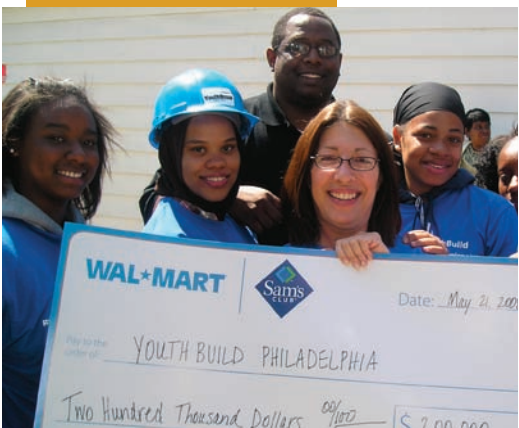
Students and staff members pose together with a Wal-Mart Foundation ceremonial check at the national press conference to announce Wal-Mart’s $5 million grant to help support YouthBuild programs nationally. YouthBuild Philadelphia received $200,000.

April 24, 2008 – YouthBuild Philadelphia celebrated Global Youth Service Day by providing volunteer services to several organizations throughout the city. In partnership with the Nicetown CDC, YouthBuild Philadelphia installed three benches in Nicetown Park, prepared a plot of land for a community garden, and cleaned and painted the curb along Germantown Avenue. At The Village of Arts and Humanities, students and staff members reset the steps of the administrative building, reinstalled a bathroom in a community center, and planted a community garden. Students and staff members also performed office space demolition for Caring About Sharing, repainted a playground space in South Philadelphia, and assisted Wireless Philadelphia in the transportation of computer equipment.