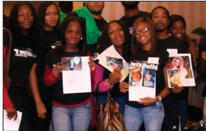
New students proudly display their YouthBuild Artifacts, here photos of family, and celebrate their induction following the acceptance ceremony.