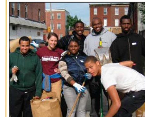
Staff mentors work as a team with their student mentees for the street clean-up.

Make a Difference Day is one of the largest community service events in the nation, bringing an estimated 3 million people out every year for a day of service. Youthbuild celebrates Make a Difference Day every year by offering all the resources of their student body and staff necessary to complete a day of service.